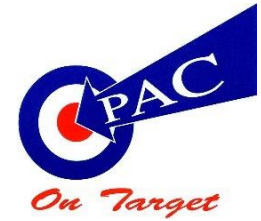
CAPS PAC Board